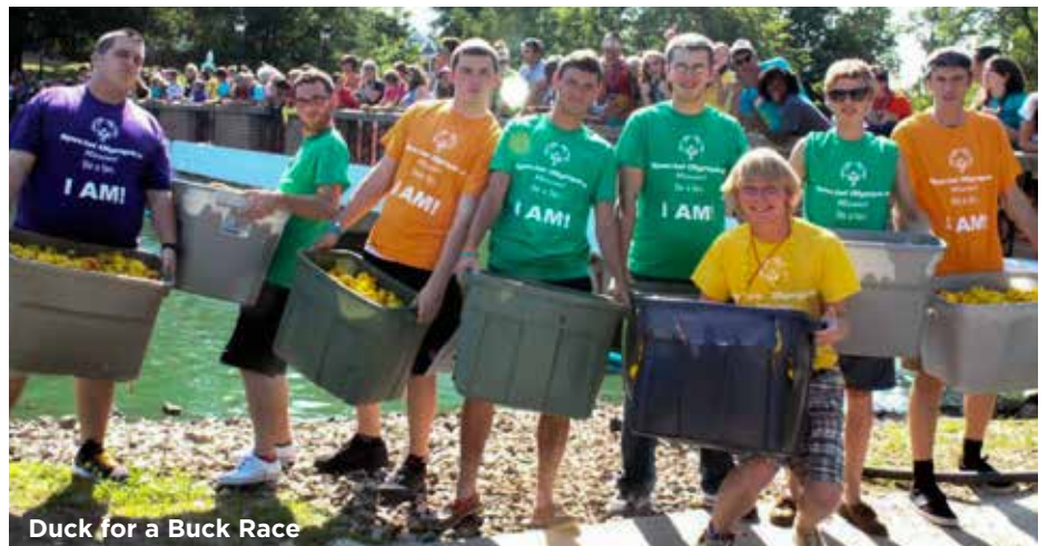
Duck for a Buck Race